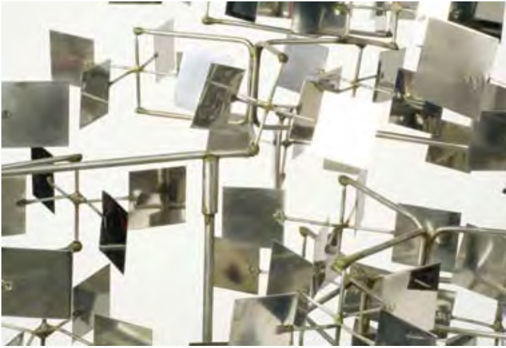
George Rickey, Crucifera III , 1964, stainless steel; on exhibit inside the South Bend Museum of Art as part of George Rickey: Arc of Development

pivot mountings. Determined to create works for public display, the sculptor devised simple yet durable devices to limit and control extreme fluctuations of movement. His dual-action shock-absorbers stretch out to decelerate a moving element at its outer limit, preventing it from going too far, and then contracts to slow the component when it swings back. Rickey was interested in technology only to further his aesthetic goals, and he usually managed to conceal these mechanisms from viewer so that the motions of the forms appear effortless, random yet ordered, fluid and silent.