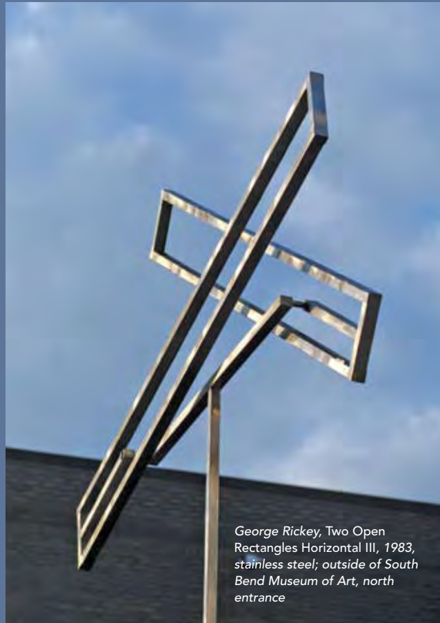
George Rickey, Two Open Rectangles Horizontal III, 1983, stainless steel; outside of South Bend Museum of Art, north entrance

Innovation: George Rickey Kinetic Sculpture could not have occurred without the support of many people and organizations. This project owes special thanks to: