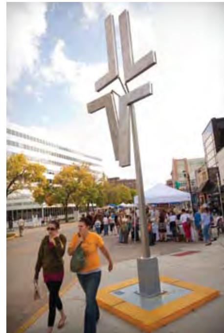
George Rickey, Four Ls Excentric II, 1978–1990, stainless steel; located at the southwest corner of Michigan and Colfax

By the end of his life, Rickey saw his sculptures installed outdoors in many cities around the world, ranging from Berlin, London, and Rotterdam to Omaha, Oakland, and Osaka, where they entice viewers into their reality. Unlike the public scorn heaped upon many kinds of abstract sculpture, Rickey’s works appeal to nearly everyone who watches them for more than a few minutes. They allow the rhythms of nature to manifest themselves, even in urban jungles. As the pace of social and personal change continues to accelerate exponentially, Rickey’s sculptures remind us that the natural world maintains its own tempos, and that ours are artificially imposed. This native son of South Bend offers us the gift of time spent in purposeless pleasure.