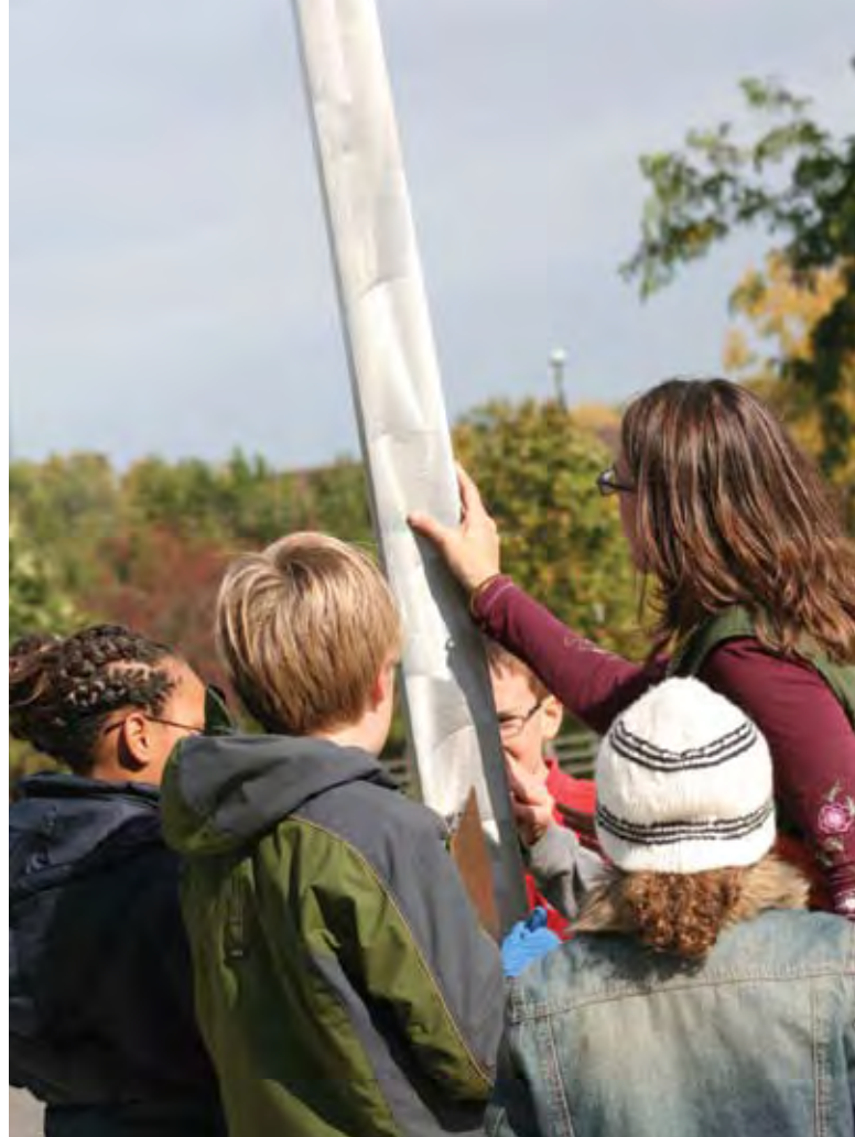
Students from Good Shepherd Montessori and their teacher investigate Rickey's Annular Eclipse V, located on the Jon R. Hunt Plaza at Michigan and Colfax in South Bend

An earlier version of this essay appeared in the Summer 2009 issue of ArtsEverywhere magazine.