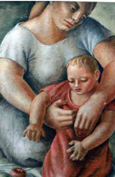
Above: George Rickey, Mother and Child (mural sketch), no date (circa 1940), gouache on board; on exhibit inside the South Bend Museum of Art as part of George Rickey: Arc of Development

Just over a century ago, the artist George Rickey was born in South Bend, and now his hometown is celebrating his life and work with Innovation: George Rickey Kinetic Sculpture , a collaboration that includes five large-scale works on the streets of downtown, five garden-scale works, a major indoor exhibition, a symposium, and many Rickey-related programs.