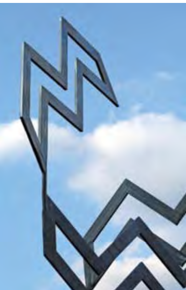
George Rickey, detail of Chevron Theme , 1990, stainless steel; located outside the South Bend Museum of Art's rotunda (main entrance)

During the 1970s and 1980s, Rickey expanded his repertoire to planar—rather than linear—geometric shapes. Flat squares, rectangles, and triangles added another kind of movement: the optical flashes of light generated by the polished steel surfaces. In the early 1960s, his friend David Smith had started using a hand-held rotary sander to etch very shallow patterns into the surfaces of his stainless-steel sculptures. Smith considered this burnishing work to be tedious, and he often delegated it to an assistant. Rickey, on the other hand, used the whirling wheel to create more prominent and calligraphic patterns of curving and circular lines. The burnished areas, being more highly polished and very slightly recessed, catch and intensify light differently from the adjacent areas [see photo of Two Planes Vertical Horizontal (gyratory) on p. 12]. Some curving patterns are more deeply or more shallowly recessed, so that each becomes visible in different lighting conditions. Even at rest on an overcast day, the burnished surface catches the pale sunlight. The combination of these rapid-fire, transient flashes of light with the deliberately sedate rotations of the main forms is both stimulating and soothing.