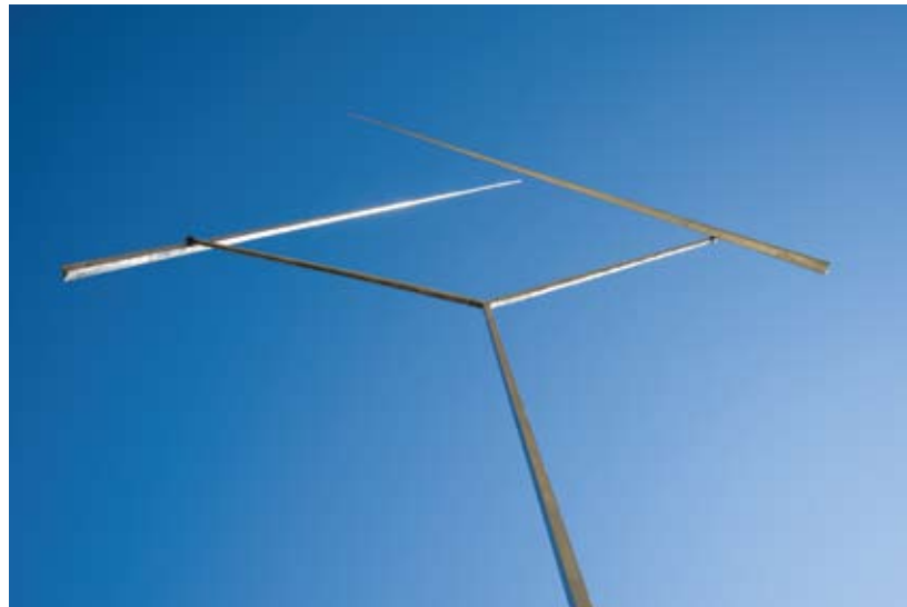
George Rickey, Two Lines Oblique , 1967, stainless steel; located at Notre Dame's Snite Museum of Art; an example of one of Rickey's "blade" sculptures

By 1958, Rickey began attaching independently pivoting elements onto slender vertical rods mounted as pendulums. As the main axis tilts and swings, the ancillary parts spin easily. Because each rotor has its own center of gravity, they can spin at different speeds. Their polished metal surfaces also catch and reflect ambient light in unpredictable and even dazzling patterns. Rickey soon worked almost entirely in stainless steel; its low-key silvery hue tended to blend easily into almost any