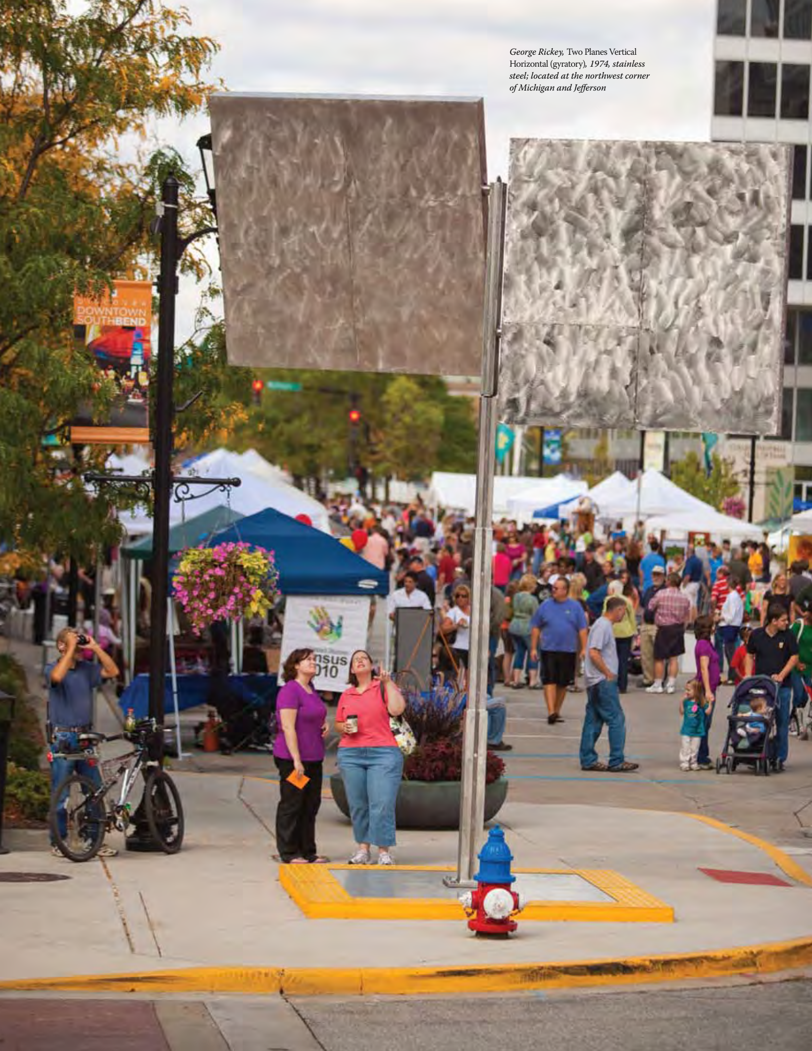
George Rickey, Two Planes Vertical Horizontal (gyratory), 1974, stainless steel; located at the northwest corner of Michigan and Jefferson