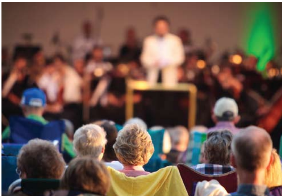
Tsung Yeh conducts the South Bend Symphony for its August 27 performance at Potawatomi Park.