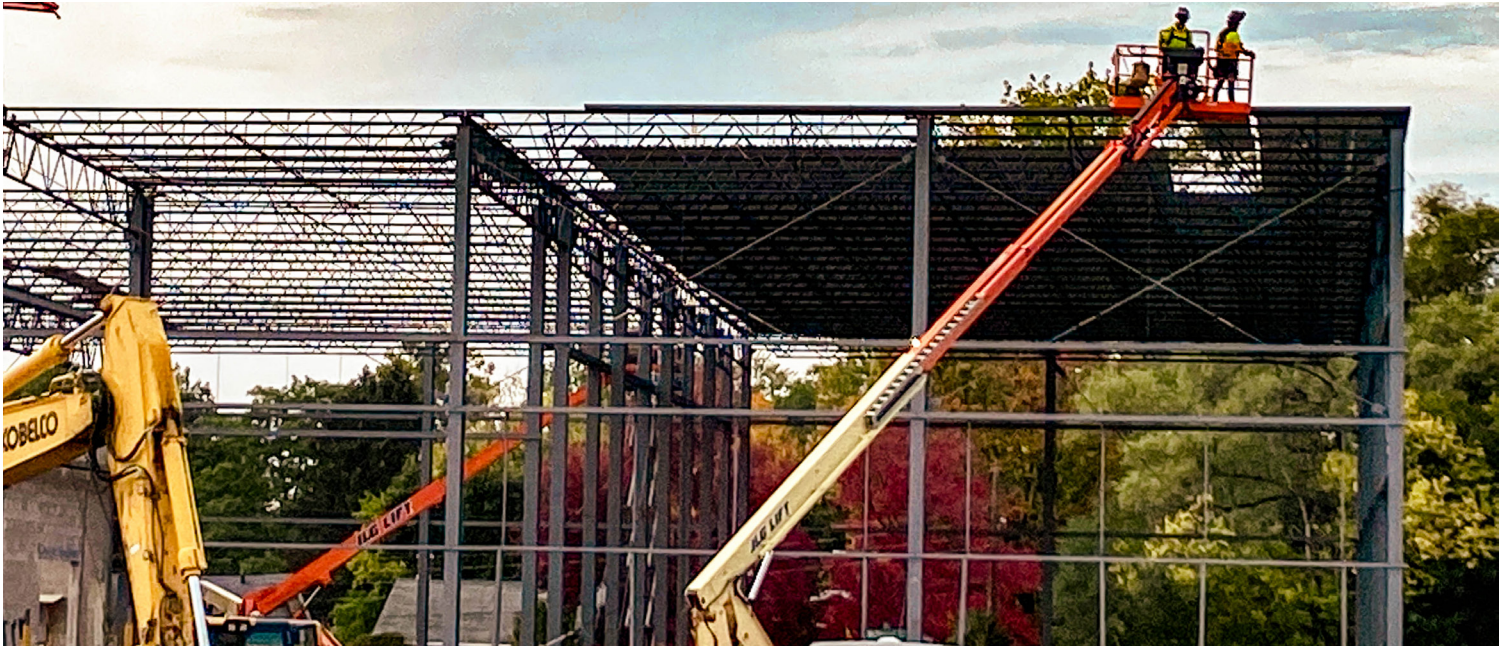
Work continues on Cultivate Culinary's Cold Storage Facility. Cultivate was the recipient of a $250,000 Special Project Challenge Grant this spring.

Thanks to Lilly Endowment Inc., your unrestricted gifts will be tripled now through 2025