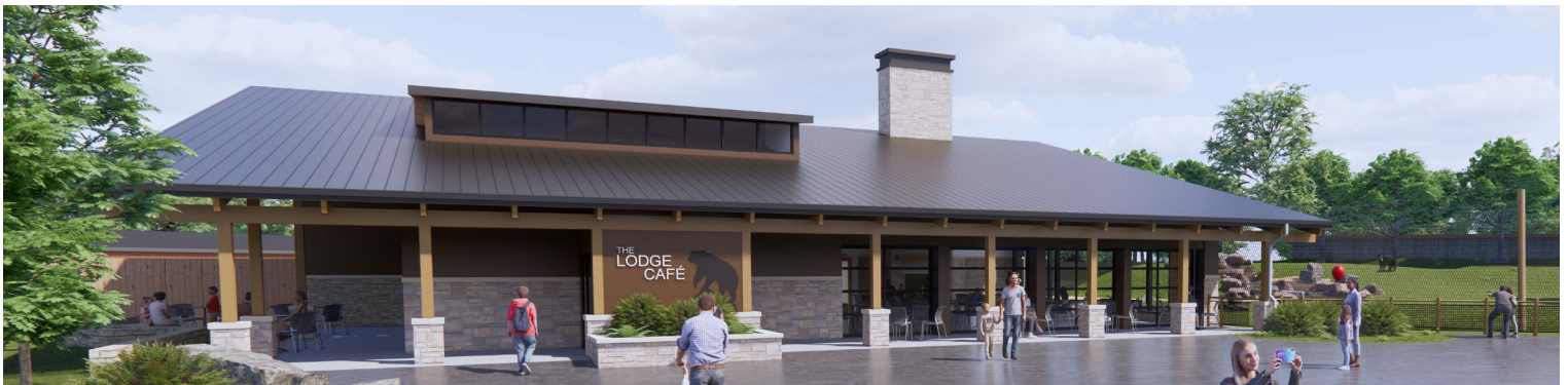
Artist's rendering of the new Concession Lodge at the Potawatomi Zoo

Non Profit Org. U.S. Postage PAID South Bend, IN Permit No. 417