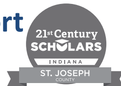
Overall Step Progression 3/31/2025: 2025 Senior Cohort

The 21st Century Scholar Success Coalition is a local partnership among school corporations, higher education, social service and mentoring agencies, and the Community Foundation of St. Joseph County to grow enrollment and completion numbers for St. Joseph County students in the 21st Century Scholars program.